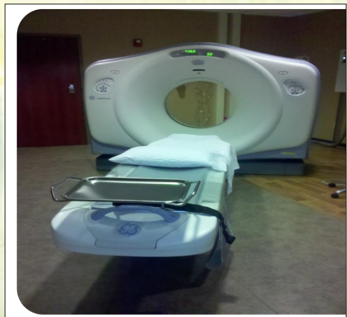
New 32 Slice CT Scanner