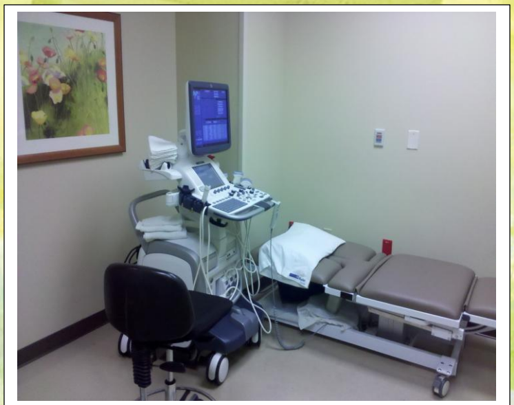
New GE Ultrasound