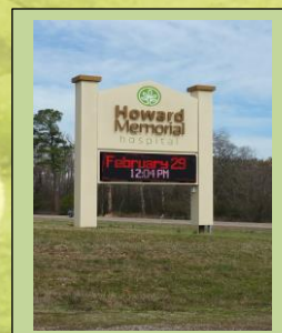
New electronic sign