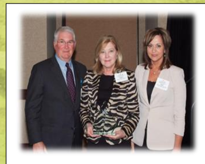
Hospital Quality Excellence Award