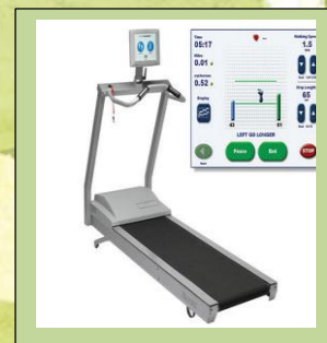
Gait Trainer Treadmill