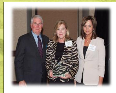
Hospital Quality Excellence Award