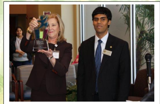
Top 100 CAH - 2012