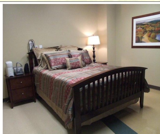
New In-house Sleep Lab