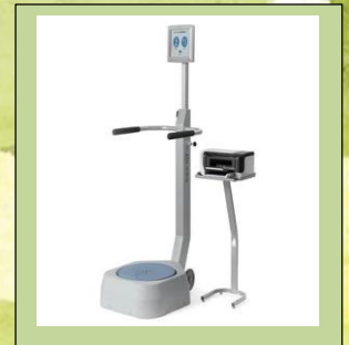
New Biodex Concussion Management System