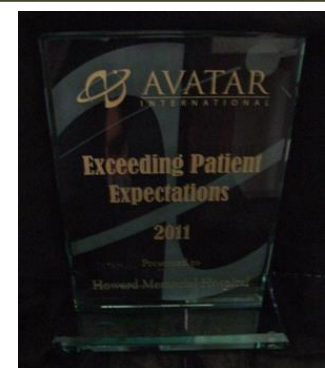
Awards 2011 and 2012